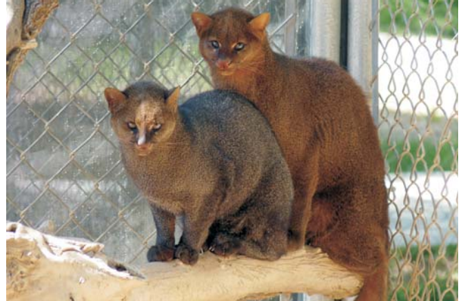
Jaguarundi, Maya and Aztec

rigorous imprisonment and fined US$40. This is the highest fine of any poaching related crime in the country.