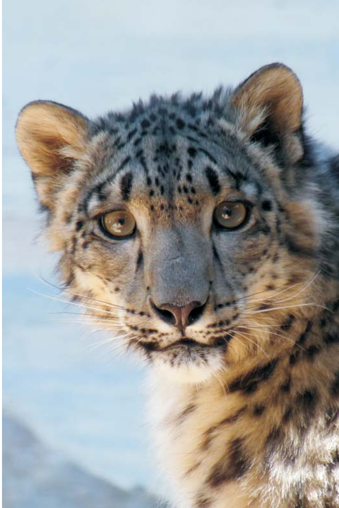
Anny, snow leopard, is adjusting to her new home, and boyfriend well.

memorable and I look forward to the next time I will be able to volunteer at the EFBC.