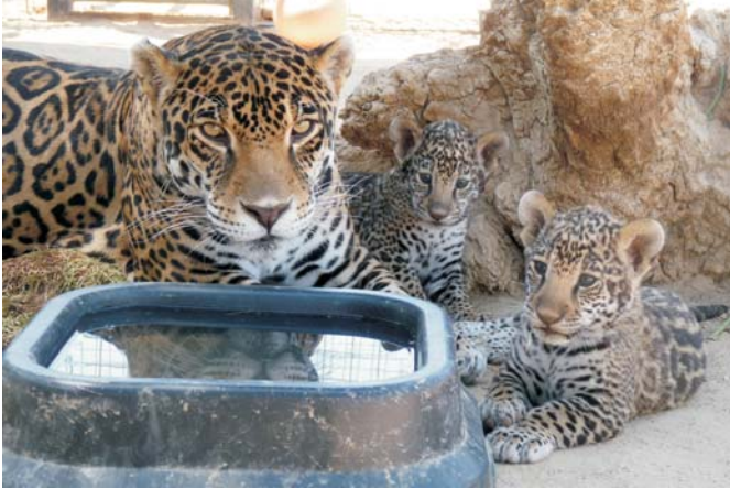
Annie and cubs

DEDICATED TO THE PROTECTION AND PRESERVATION OF ENDANGERED FELINES Fall 2009