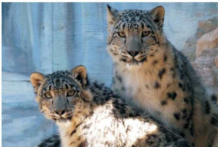
While the heat of the desert has kept Anny and Zack in their den box during the day, the cooler weather will likely see them out during visiting hours.

In the wild, Armenia, possibly western Turkey, Iran, and Afghanistan are among the only remaining wild areas for this leopard. Fragmented populations are often shot on sight, and it is clear that people that would eliminate felines from the earth are many, and those that wish to save them are few. Thank you all for being part of the effort to preserve and protect them. This leopard once roamed a broad range that it shared with another great cat, the Caspian Tiger. The Caspian Tiger is now extinct, both in the wild and in captivity. Although leopards are more adaptable, the outlook for this sub-species is grim. Those of you that have been out to see Shapur may not realize it, but you have seen a sub-species of leopard that numbers just five in North America. Through the import of two Panthera Pardus Saxicolor (1.1) from the European continent, we look forward to announcing some new "American-Persian leopard" cubs in the future.