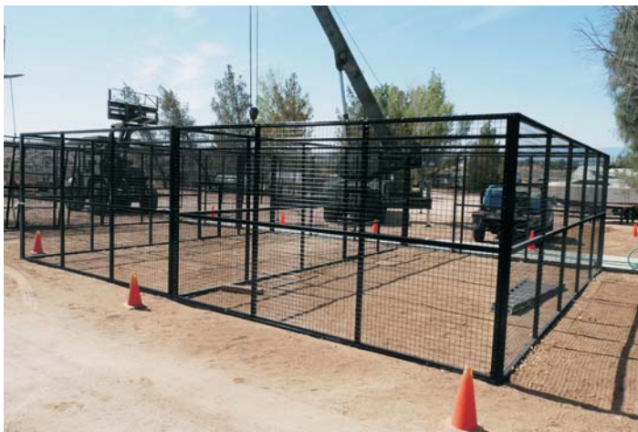
New caging is being constructed quickly where the old "main" enclosures once stood. The cage space is needed!

Working at EFBC/FCC was a life-changing experience for me. I can't imagine what my life would be like without it. When people ask me why I continue to drive 5 hours on a Saturday to work three hours at a Twilight Tour and then drive back home immediately the next morning, I can't really put it into words they'll understand...unless they've visited the EFBC, seen the cats, held a baby