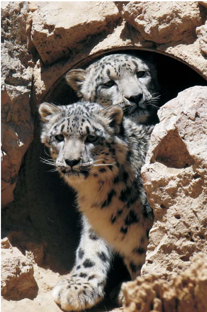
Zach and Annye investigate their new home, one of the large natural enclosures in the educational area.

DEDICATED TO THE PROTECTION AND PRESERVATION OF ENDANGERED FELINES SUMMER 2009