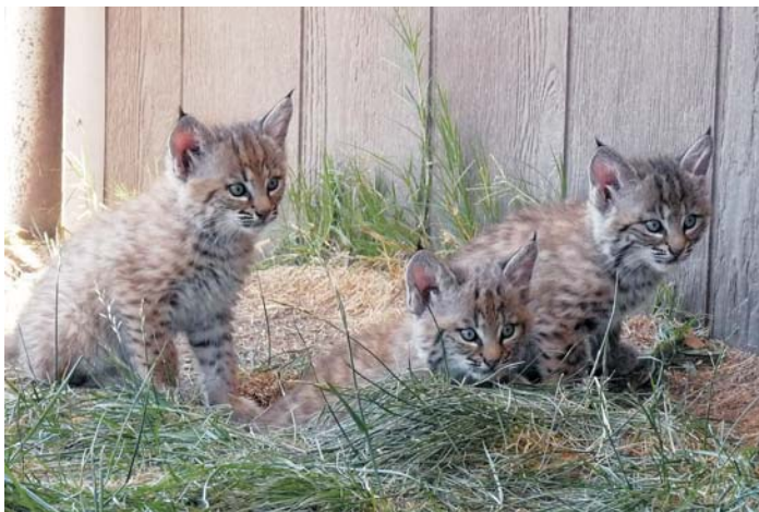
These adorable kittens are being hand raised, off display.

Typical signs of inbreeding include crossed eyes, curvature of the spine, twisted necks, and shortened tendons in the legs. As inbreeding